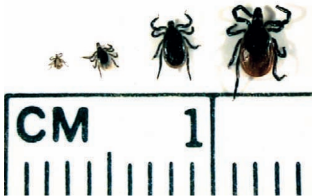
Figure 1. From left to right, an Ixodes scapularis larva, nymph, adult male tick, and adult female tick.

1 month after removing an attached tick should promptly seek medical attention to assess the possibility of having acquired a tickborne infection. HGA and babesiosis should be included in the differential diagnosis of patients who develop fever after an Ixodes tick bite in an area where these infections are endemic (A-II). A history of having received the previously licensed recombinant outer surface protein A (OspA) Lyme disease vaccine preparation should not alter the recommendations above; the same can be said for having had a prior episode of early Lyme disease.