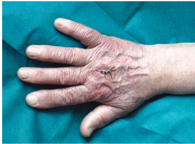
Figure 4. Illustrative example of a patient with acrodermatitis chronica atrophicans. The picture is a generous gift from Dr. Franc Strle (University Medical Center, Ljubljana, Slovenia).

1. Available data indicate that acrodermatitis chronica atrophicans may be treated with a 21-day course of the same antibiotics (doxycycline [B-II], amoxicillin [B-II], or cefuroxime axetil [B-III]) used to treat patients with erythema migrans (tables 2 and 3). A controlled study is warranted to compare oral with parenteral antibiotic therapy for the treatment of acrodermatitis chronica atrophicans.